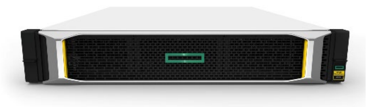
HPE MSA 2050 SAN Storage