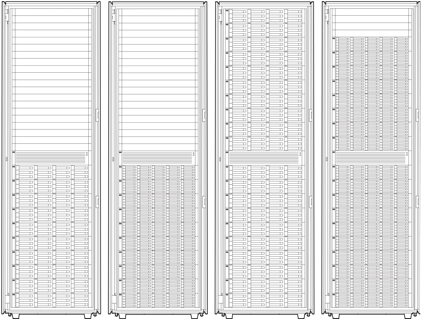
EVA P6350 2C10D